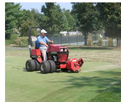
All segments of the turf industry will be covered in the Short Course

Faculty and staff of Virginia Tech's Turfgrass Management Team lead all educational programs.